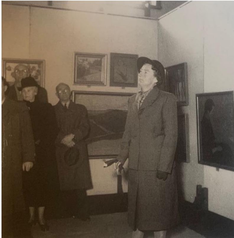
The opening of the exhibition in Simrishamn in 1950 showing the present work on the right hand side