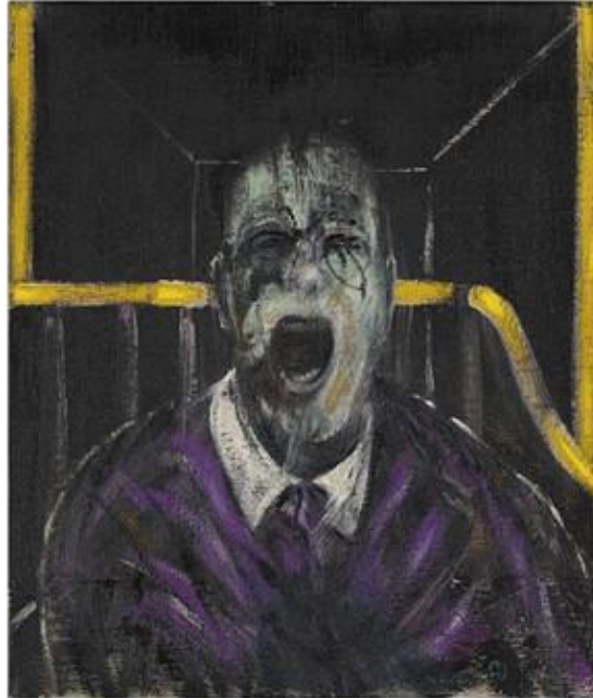
Fig. 1: Francis Bacon, Study for a head , from Bacon's "screaming popes" series, oil on canvas, private collection.

THOS. AGNEW & SONS LTD. 6 ST. JAMES'S PLACE, LONDON, SW1A 1NP Tel: +44 (0)20 7491 9219. www.agnewsgallery.com