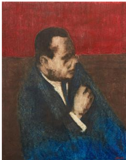
Fig. 2: James Francis Gill (b. 1934), Portrait of a man , oil on canvas.