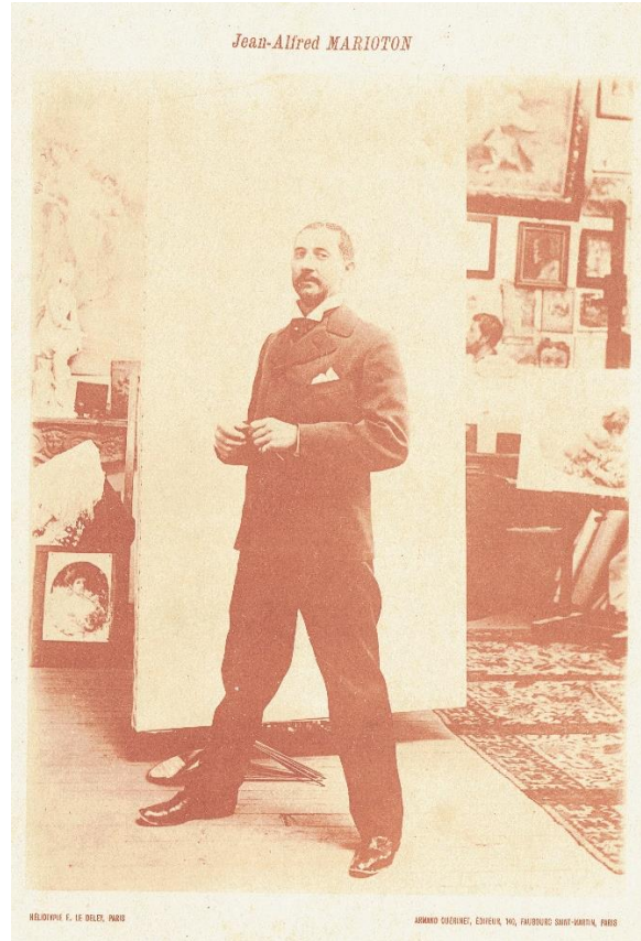
Fig. 2: A photograph of Jean-Alfred Marioton, from ' Dessins, croquis, études de figures des peintures décoratives de Jean-Alfred Marioton ', published by his brother Claudius Marioton - Bookstore of Decorative Art Armand Guérinet, 140 faubourg Saint-Martin in Paris - Reproduction by heliotype at E. Le Delay in Paris - undated, probably from 1905.