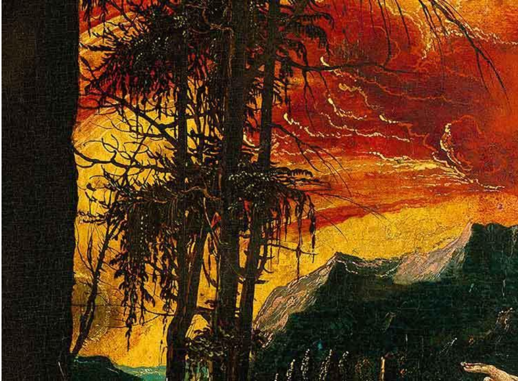
Detail of fig. 1.

THOS. AGNEW & SONS LTD. 6 ST. JAMES'S PLACE, LONDON, SW1A 1NP Tel: +44 (0)20 7491 9219. www.agnewsgallery.com