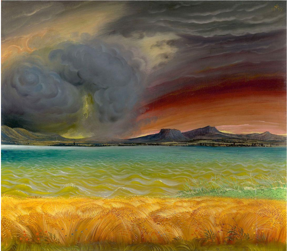
Fig. 4 Otto Dix, Lake Constance landscape in stormy weather , 1939, mixed media on wood, 70 x 79.8 cm, private collection.

THOS. AGNEW & SONS LTD. 6 ST. JAMES'S PLACE, LONDON, SW1A 1NP Tel: +44 (0)20 7491 9219. www.agnewsgallery.com