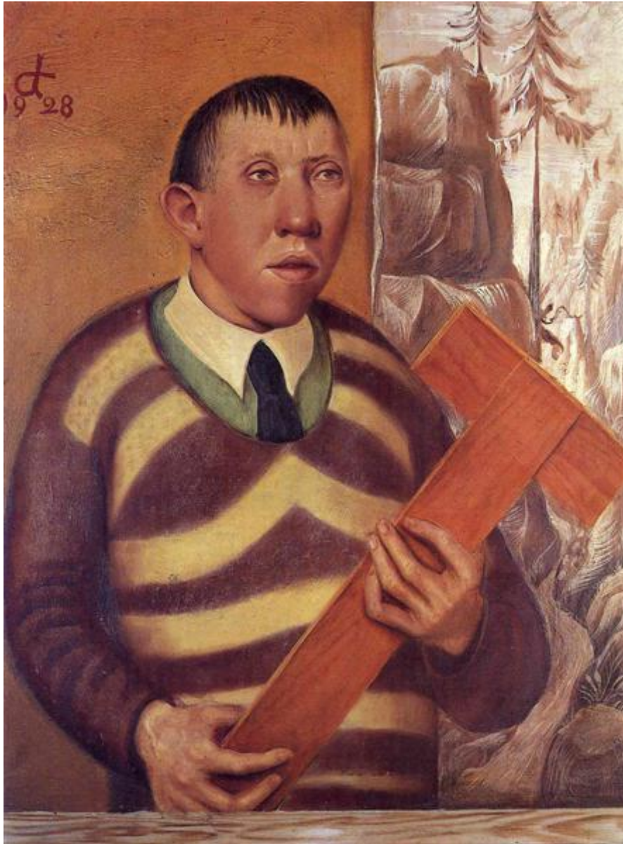
Fig. 3 Otto Dix, Portrait of the painter Franz Radziwill , 1928.

THOS. AGNEW & SONS LTD. 6 ST. JAMES'S PLACE, LONDON, SW1A 1NP Tel: +44 (0)20 7491 9219. www.agnewsgallery.com