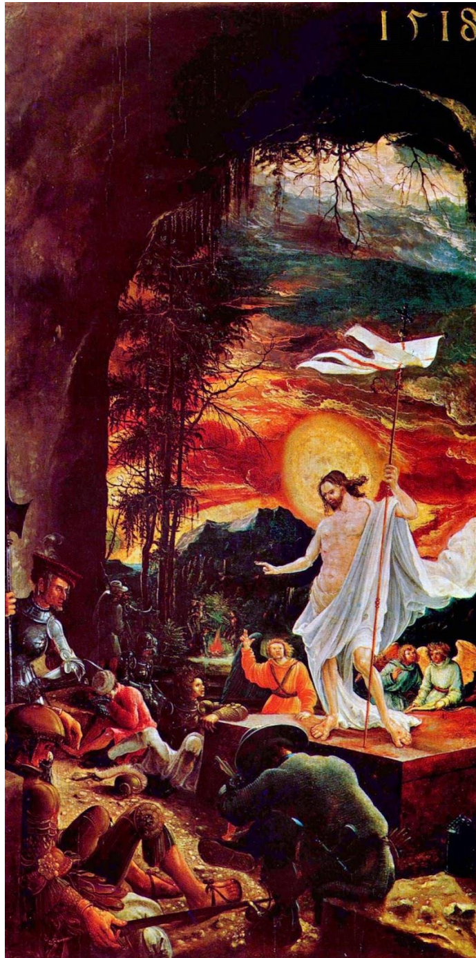
Fig. 1: Albrecht Altdorfer, The Resurrection of Christ , 1518, Kunsthistorisches Museum, Vienna, Austria.

THOS. AGNEW & SONS LTD. 6 ST. JAMES'S PLACE, LONDON, SW1A 1NP Tel: +44 (0)20 7491 9219. www.agnewsgallery.com