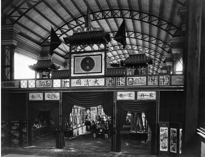
Fig. 4. Chinese pavilion at the Viennese World Exhibition in 1873.

THOS. AGNEW & SONS LTD. 6 ST. JAMES'S PLACE, LONDON, SW1A 1NP Tel: +44 (0)20 7491 9219. www.agnewsgallery.com