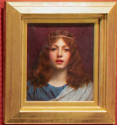
Small white informational card below the portrait painting.