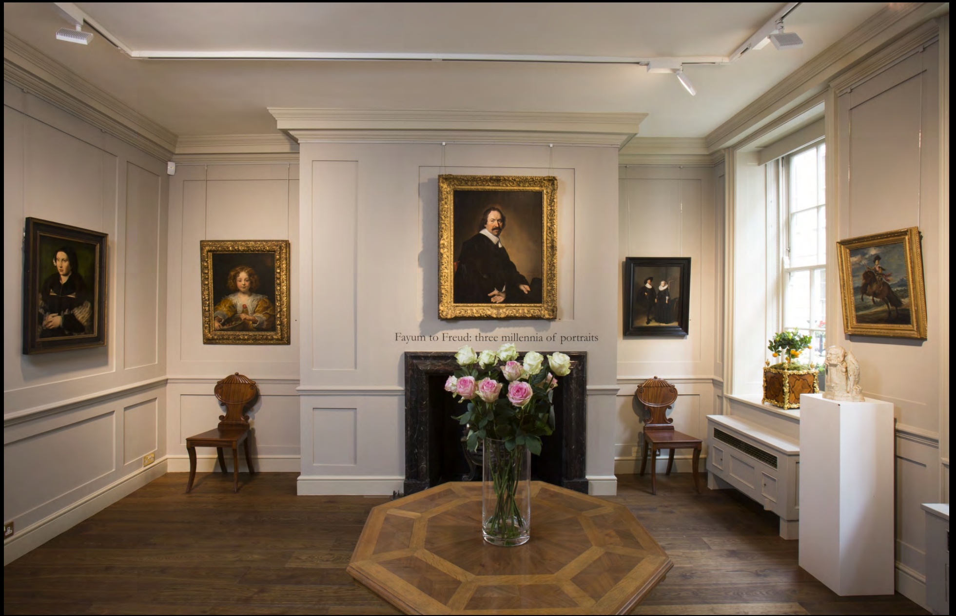
Fayum to Freud: three millennia of portraits