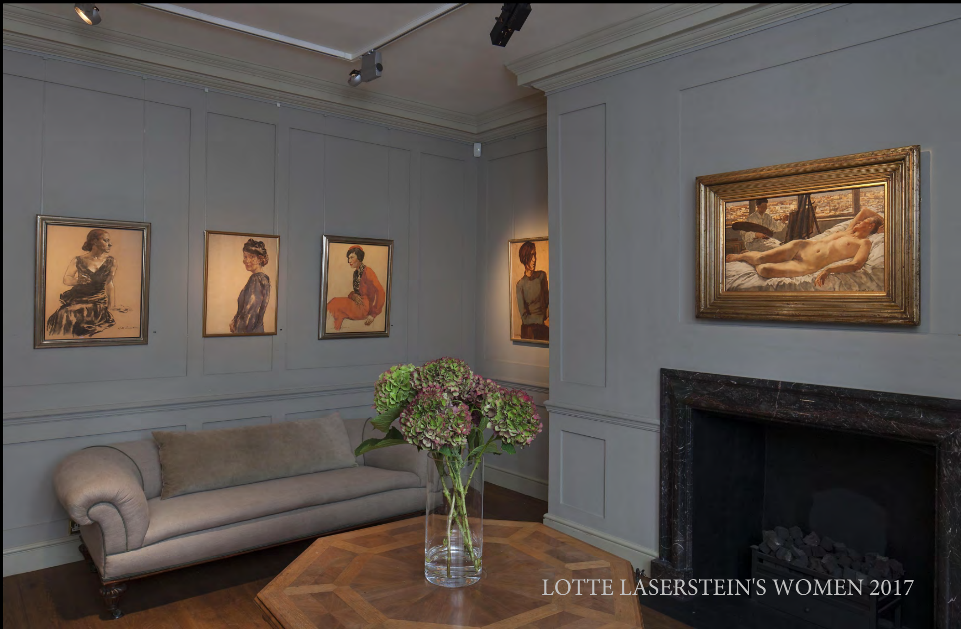
LOTTE LASERSTEIN'S WOMEN 2017