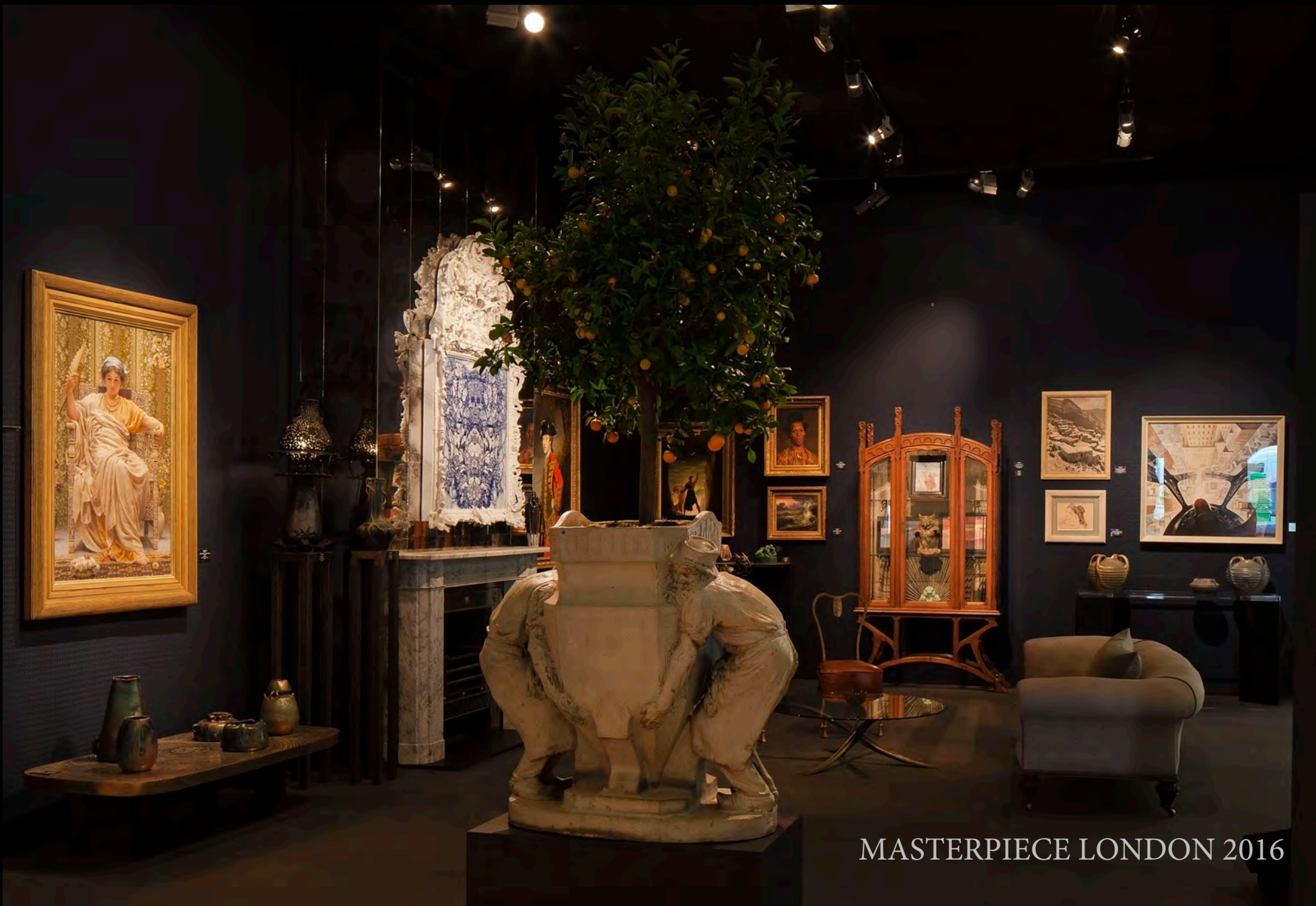
MASTERPIECE LONDON 2016