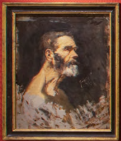
Small white informational card below the portrait painting.