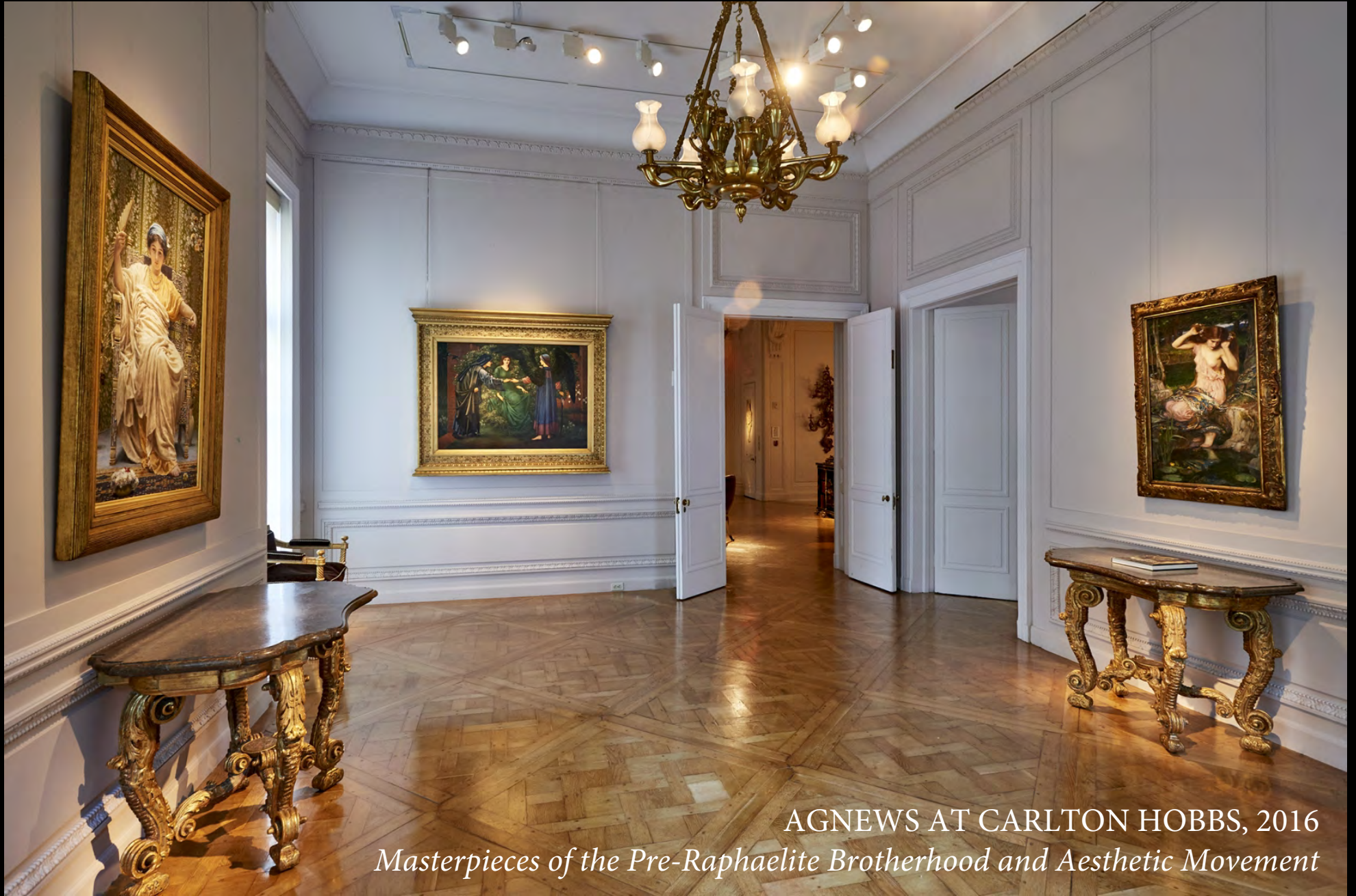
AGNEWS AT CARLTON HOBBS, 2016 Masterpieces of the Pre-Raphaelite Brotherhood and Aesthetic Movement