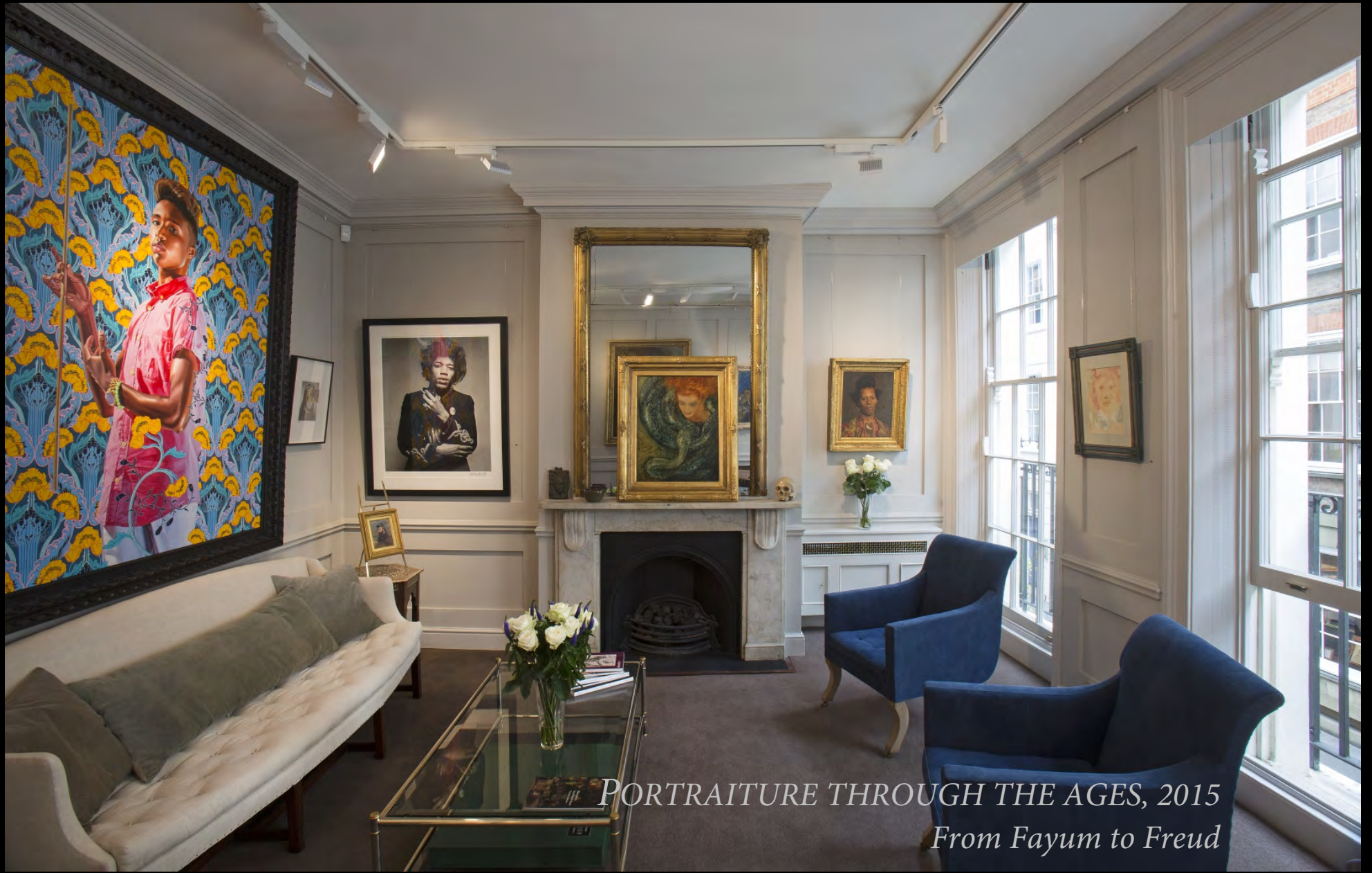
PORTRAITURE THROUGH THE AGES, 2015 From Fayum to Freud