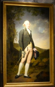
PATRONAGE AS POWER Joseph Wright of Derby (1734-1797)